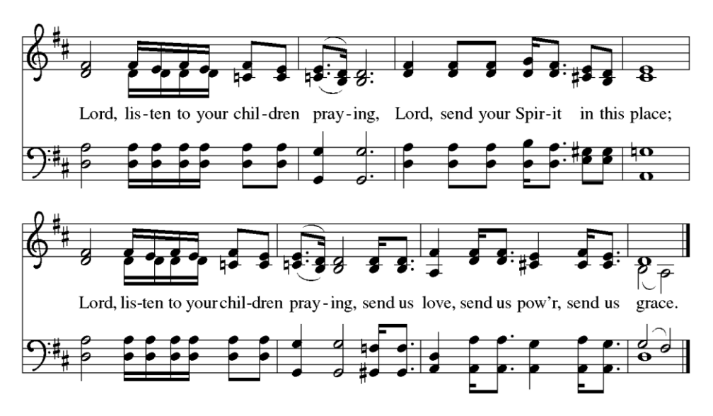
ELW #752 "Lord Listen to Your Children Praying"

A: God our light, you know our weakness. Free all who govern from the temptations of power. Sustain all who work for human rights in every nation.