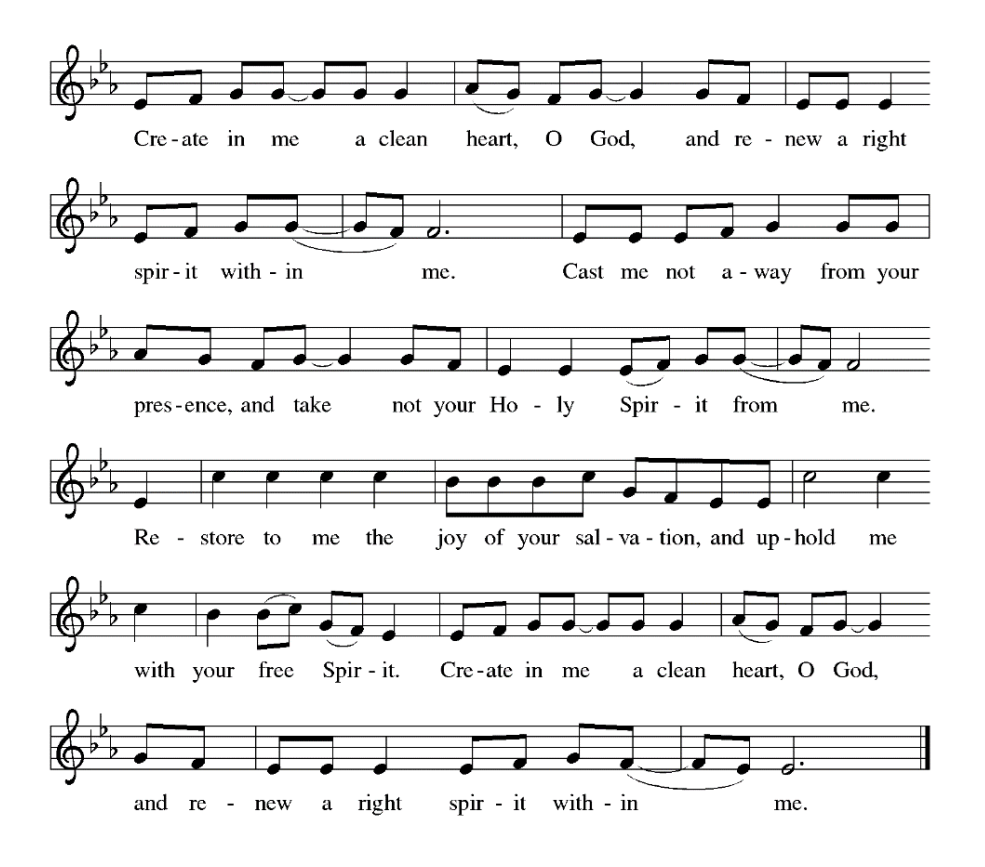
ELW #185 "Create in Me a Clean Heart"